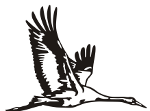
Grue cendrée 433AB 46 x 35 cm -2 = +1 +2 +3 +4