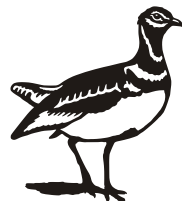
Outarde canepetière 311 38 x 43 cm = +1 +2 +3 +4