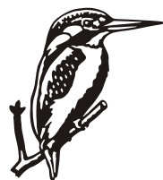
Martin pêcheur 296 38 x 43 cm -2 = +1 +2 +3 +4