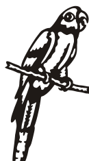
Perroquet 249 28 x 52 cm -2 = +1 +2 +3 +4