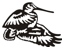
Bécasse 248C 44 x 32 cm = +1 +2 +3 +4