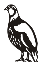
Perdrix 309C 26 x 43 cm -2 = +1 +2 +3 +4