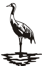
Grue cendrée 433B 35 x 53 cm = +1 +2 +3 +4