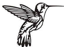
Colibri 134B 47 x 34 cm -2 -1 = +1 +2 +3 +4