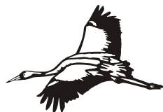
Grue cendrée 433 50 x 34 cm -2 = +1 +2 +3 +4