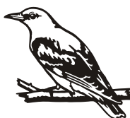
Loriot 421 40 x 35 cm -2 = +1 +2 +3 +4