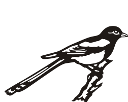
Pie 198 54 x 33 cm = +1 +2 +3 +4