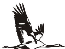
Grue cendrée 433AE 46 x 34 cm -2 = +1 +2 +3 +4