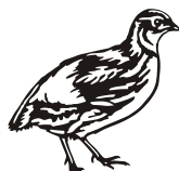
Caille 309F 35 x 35 cm -2 = +1 +2 +3 +4