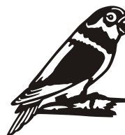
Agaponis 444 38 x 41 cm -2 = +1 +2 +3 +4