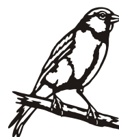
Canari 445 37 x 42 cm -3 -2 = +1 +2 +3 +4