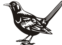
Merle 368 48 x 35 cm -2 = +1 +2 +3 +4