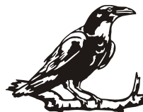
Corbeau 389 45 x 34 cm -2 = +1 +2 +3 +4