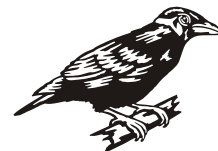
Mainate 528 46 x 32 cm -2 = +1 +2 +3 +4