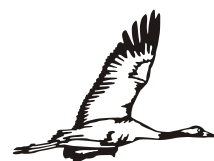
Grue cendrée 433AH 45 x 34 cm -2 = +1 +2 +3 +4